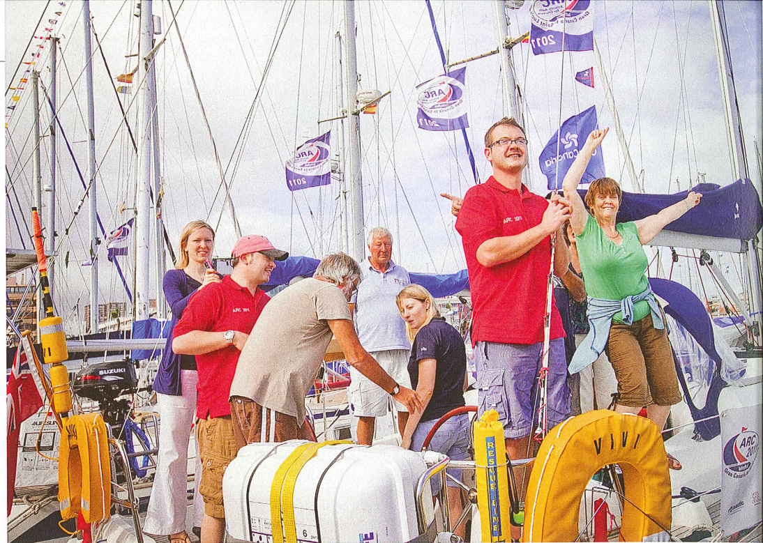
ABOVE ARC Participants prepare for departure across the Atlantic

“That’s because these rallies genuinely can be life-changing experiences. To see the friendships that are made along the way is really part of the magic of organising these events; it’s what makes it worthwhile for us and keeps us pushing on with these rallies year on year.”